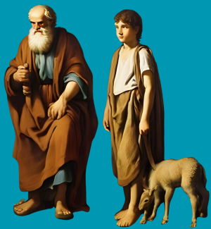
ABRAHAM & ISAAC