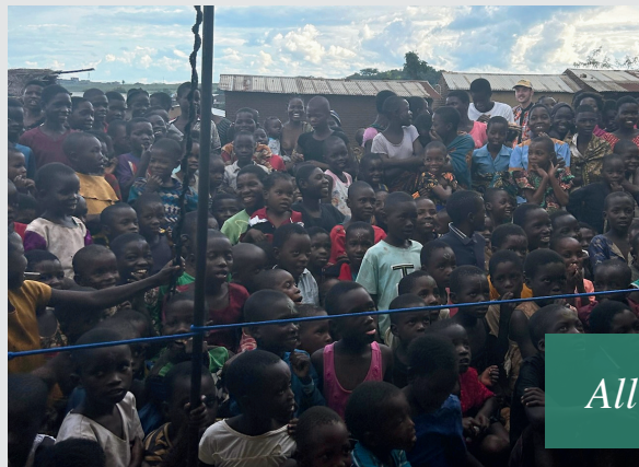
All those kids!

Over 3 days, our team split up into groups with some of the leaders and members of the church. In Malawi they speak Chichewa, so we had to have a translator while in the villages (which was a brand new experience for me!). We had a lot of great conversations with people, and we got to share the Gospel with them. Some highlights were that I led someone in the salvation prayer for the first time, we got to pray over everyone we met, and I got to explain what baptism was to one man. He was asking me questions about what it meant, and he said that he wanted to give his life to Christ! Another cool part...this was all happening in front of a Muslim, so I pray that a seed was planted for God to water!